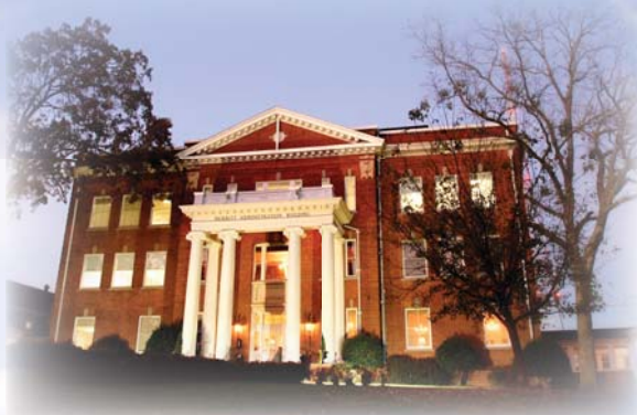
Anderson University Merritt Administration building at night.

full slate of theatrical productions and concerts by the highly regarded College of Visual and Performing Arts.