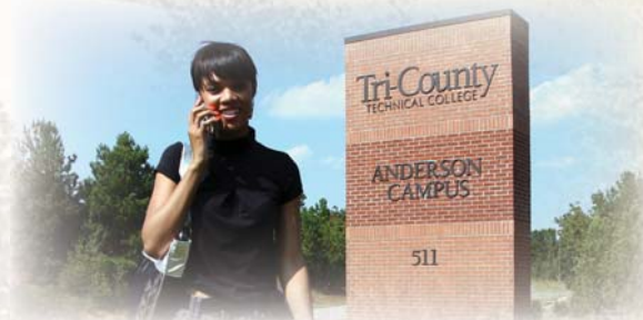
Anderson residents enjoy the convenience of the new Anderson Campus of Tri-County Technical College, which opened in 2007 and is located on Michelin Boulevard.

With many recent advancements and massive expansions to our educational system both in capital investments, teachers and curriculum, Anderson County is poised for the future and is leading our community to educational excellence. For a complete list of public schools and universities, please see page 34.