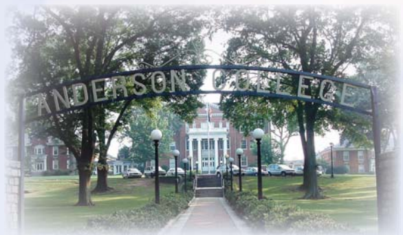
Anderson University will celebrate its 100 year anniversary in 2011.

AU was founded in 1911. Over the years, it has grown into a well-respected Liberal Arts-based comprehensive university with